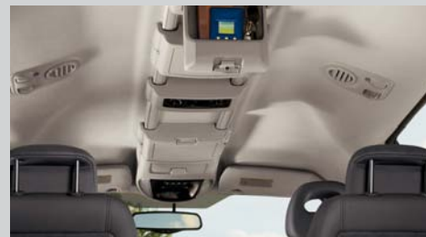
Overhead rail system