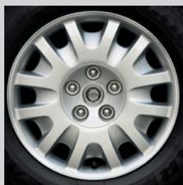
Cache wheel cover