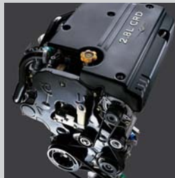
2.8 CRD engine