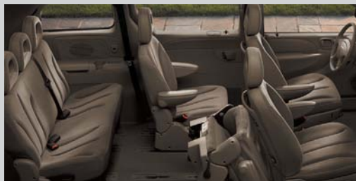
Voyager SE cloth interior