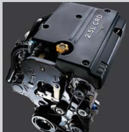
2.5 CRD engine