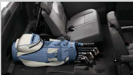
Split-fold 3rd row