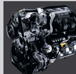
3.3 V6 engine