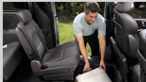
Second-row storage bin