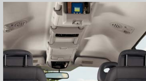
Overhead rail system