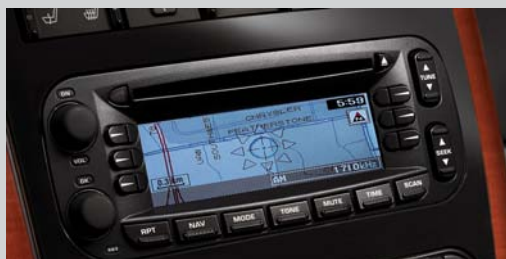
Available GPS Navigation System