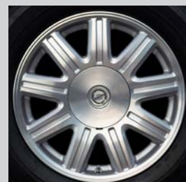
Consul aluminum wheel